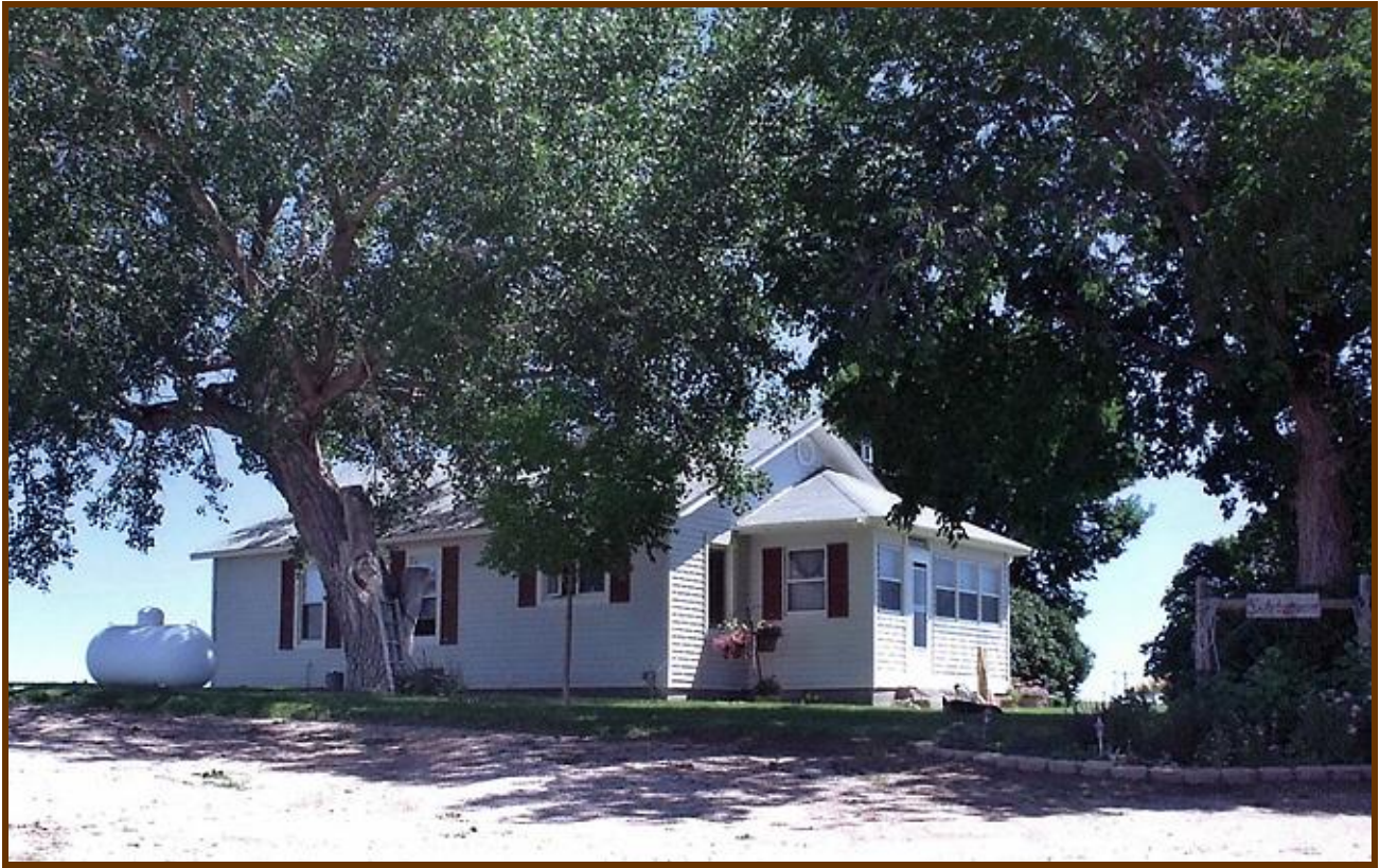
Headquarters residence and barn